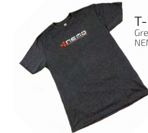
T-Shirt Grey or Black with NEMO Logo