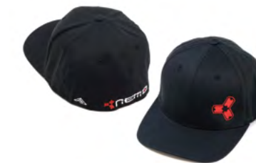
Fitted Cap Black Tri-Bolt