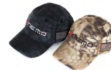
Adjustable Cap NEMO Logo w/ Kryptek