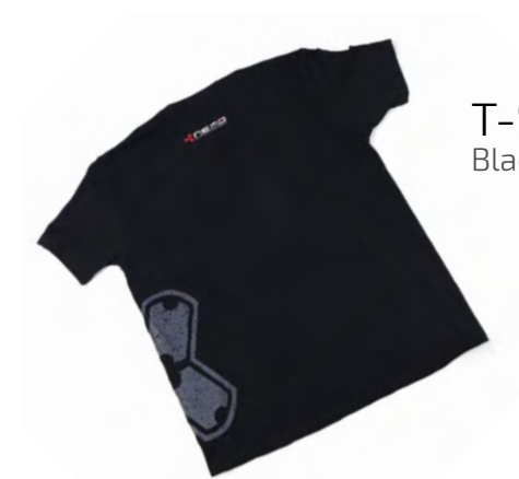
T-Shirt Black Tri-Bolt

Shirts and hats for the range, or out on the town, NEMO has you covered.