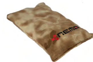
Sandbag Highlander Kryptek